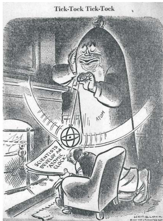
"TICK-TOCK TICK-TOCK" —A 1949 Herblock Cartoon, copyright by The Herb Block Foundation

Mayors for Peace is a movement of cities world-wide for total abolition of nuclear weapons, first proposed in 1982 by the then-mayor of Hiroshima, Japan, Takeshi Araki.